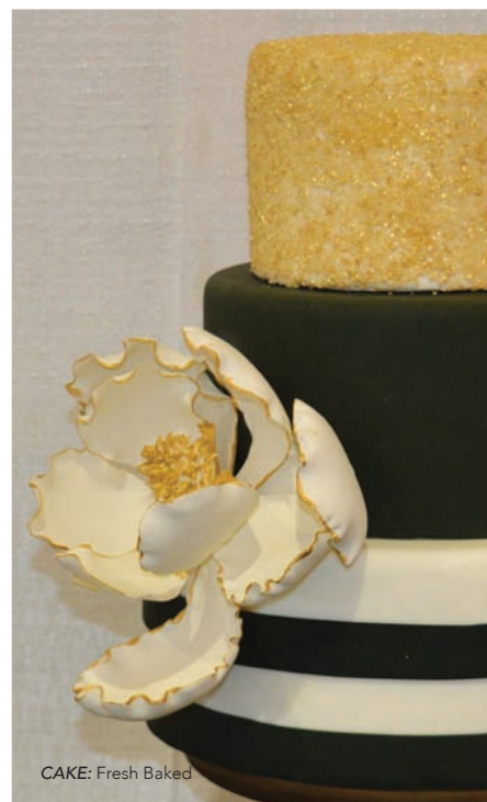
CAKE: Fresh Baked

"The ultimate in individual cake design is often to use the bride's dress as a pattern to design the cake, which normally involves a dress design visit. This means the bride would take her dress to the baker and have them design the cake with it being inspired by the dress. A lot of times fabric patterns and techniques can be used and duplicated onto the frosting." ♥